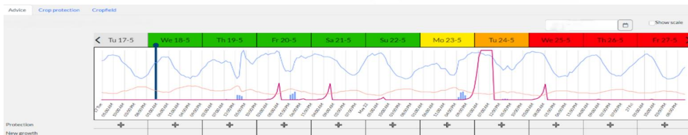
Interface of the Farmmaps potato late blight DSS. Weather data and infection events (purple line) are given in the graph. Here, an infection event is calculated for 24 May. The colours in the top bar indicate the spray advice. Green: no spray advice, Yellow: preventive spray advice, orange: curative spray advice and red: eradicator spray advice. Preventive spray advice is given for 23 May.